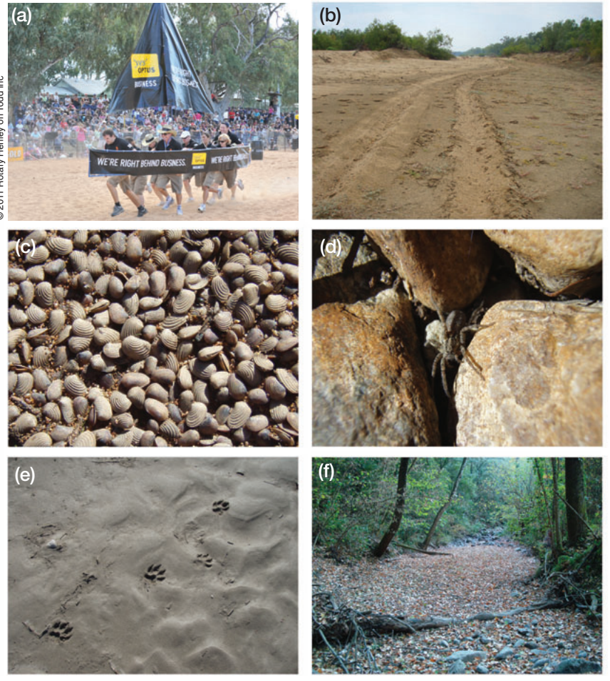
Figure 3. Values of dry riverbeds: (a) cultural significance – the Henley-on-Todd Regatta (Todd River, Northern Territory, Australia); (b) vehicle transport route (Mitchell River, Queensland, Australia); (c) egg banks for aquatic biota, such as clam shrimp (Branchiopoda: Spinicaudata) (Northern Territory, Australia); (d) habitat for terrestrial biota, such as wolf spiders (Araneae: Lycosidae) (Northern Territory, Australia); (e) wildlife corridors (Tagliamento River, Friuli-Venezia Giulia, Italy); and (f) storage sites for organic matter, such as leaf litter (Riera de Fuirosos, Catalonia, Spain).

Dry riverbeds often act as egg banks for aquatic invertebrates and seed banks for aquatic plant, algal, fungal, and bacterial propagules (Williams 2006; Lake 2011). Some aquatic crustaceans live exclusively in temporary waters and require, or benefit from, a desiccation phase in order