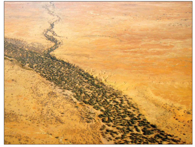
Figure 1. In arid regions, dry riverbeds may be where the most diverse and most dense vegetation is found, as shown in this aerial photograph of a dry river channel in the Lake Eyre Basin, Australia.

The drying of a riverbed represents a loss of longitudinal connectivity for aquatic biota as well as for physical aquatic processes throughout the river network (Figure 2). During a flow event, previously isolated populations